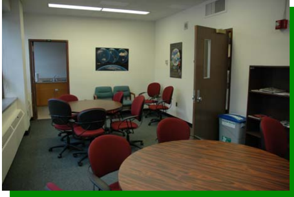
Lunchroom and Kitchen